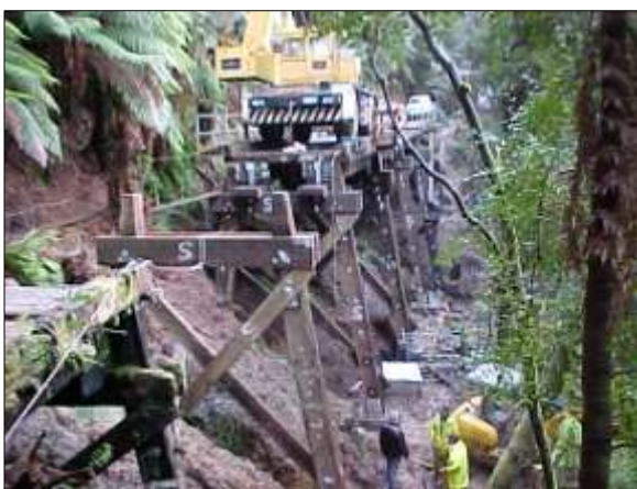
Figure 9 Timber replica bridge under construction with part of old bridge lower left c2000 (Cooper)

The environment through which the railway travels reflects its century-long history of human intervention and impact, from the orange-coloured mines tailings that border the King River to the remnant Rhododendron and Fuchsia plantations at the fettler cottage locations dotted along the route. The preservation of cultural and heritage aspects of the railway became a key focus of the environmental assessment and restoration process. Adherence to the original route location, minimal impact on the railway cuttings, the restoration of the few remaining structures and the design and construction of the replacement bridges were singled out for specific attention to reflect the heritage significance of the rail infrastructure. The majority of the original timber trestle bridges were replaced with steel trestle bridges positioned on the original bridge foundations, with four bridges being constructed with replica squared timber trestles, corbels and girders.